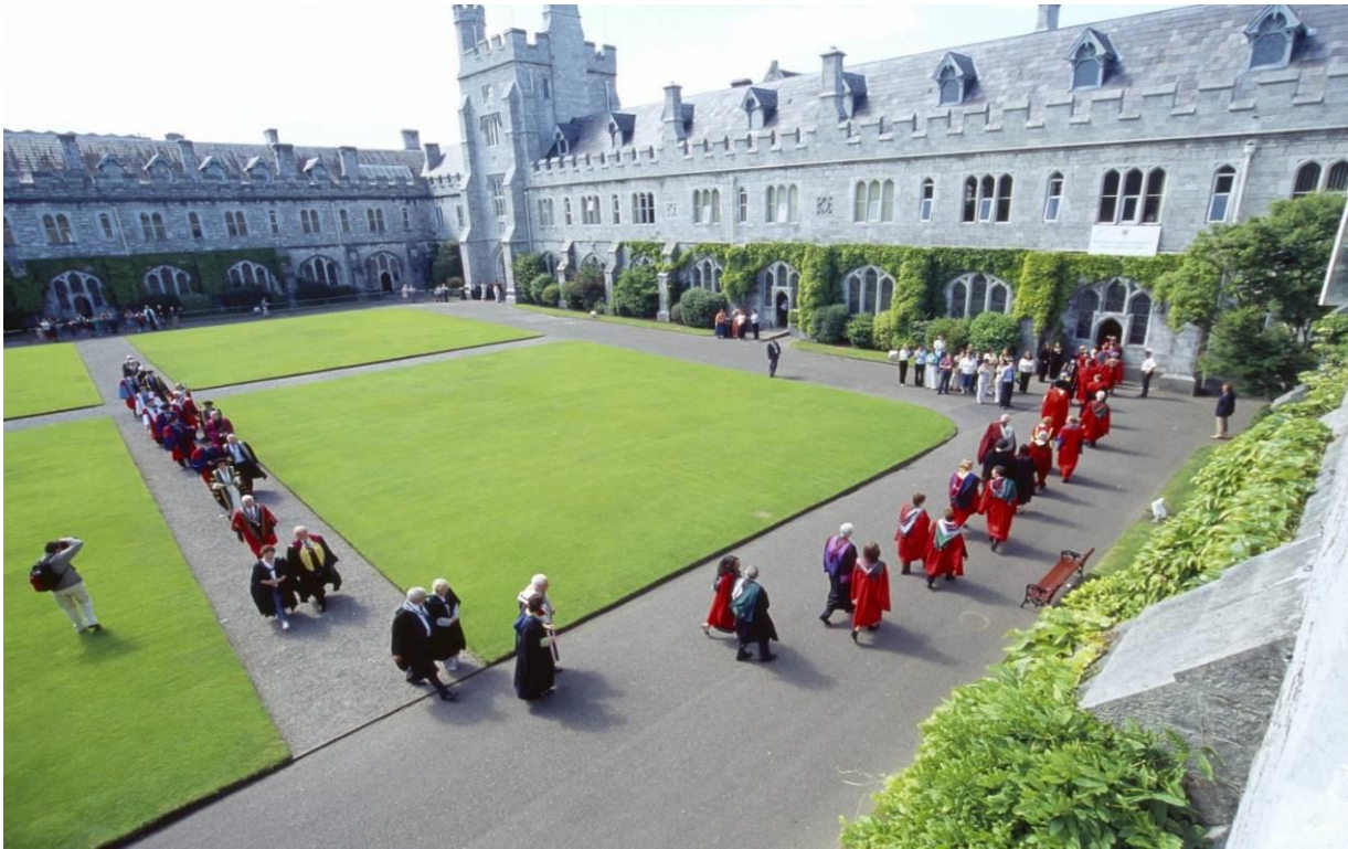
The Main Quadrangle